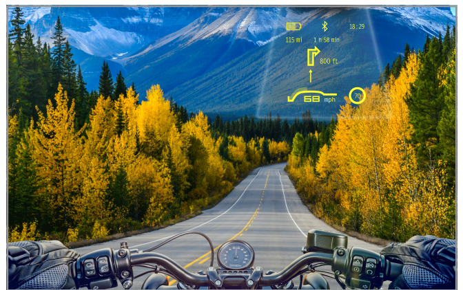
Already available and in use: The Head-Up Display for motorcycle helmets from "Tilsberk" (a brand of digades GmbH)

Picture in printable resolution: www.fep.fraunhofer.de/press