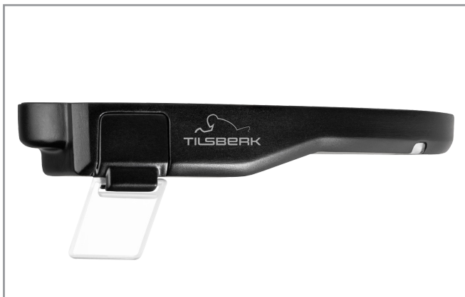
Head-up module for motorcycle helmets with integrated display and optics

Picture in printable resolution: www.fep.fraunhofer.de/press