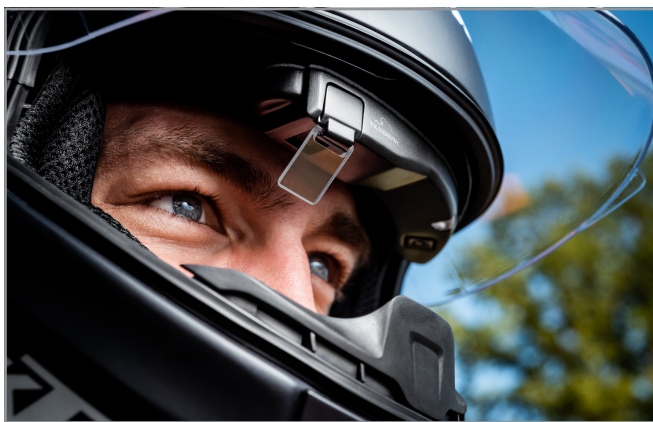
Already available and in use: The Head-Up Display for motorcycle helmets from "Tilsberk" (a brand of digades GmbH)